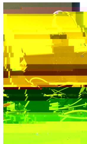
Figure: Scanning Electrochemical Microscope